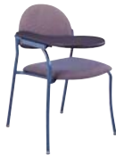
Radius Back Right-handed Tablet Arm Upholstered Back Upholstered Seat