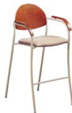
Radius Back With Arms Wood Back Upholstered Seat Wood Armcaps