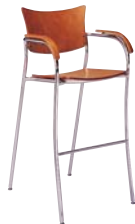
Flared Back With Arms Wood Back Wood Seat Wood Armcaps