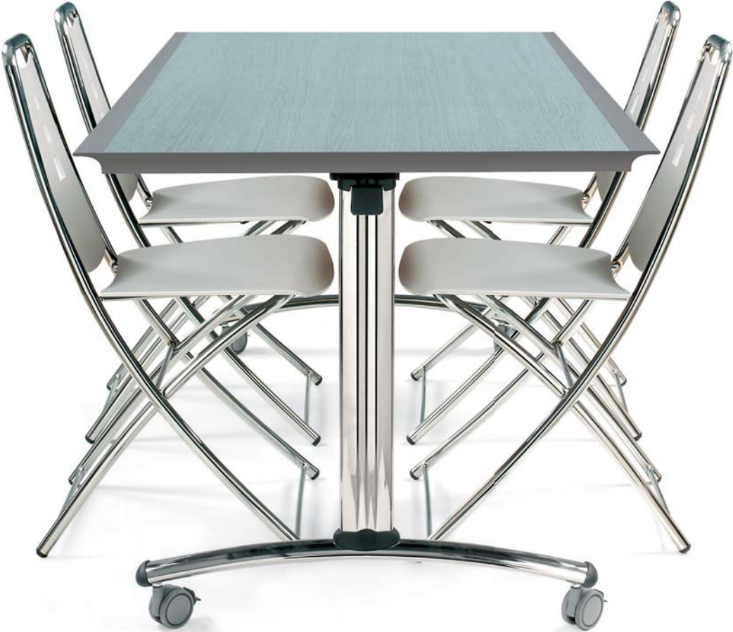
Zii / Drive Chairs and Tables