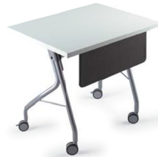
Optional Modesty Panel

Add comfort and ergonomics by adding our new MT7 Ergoflex edge, which provides flexible and stable arm support. The table shown on the facing page features this edge.