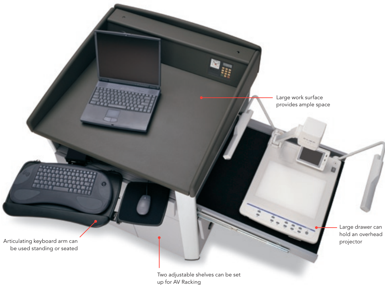
S2IM 202 Mobile Instruction Center Shown with feature detail, the 202 Mobile Instruction Center provides ample space for your laptop and reference material. Shelves and easy access to power strips support your presentation media and equipment.