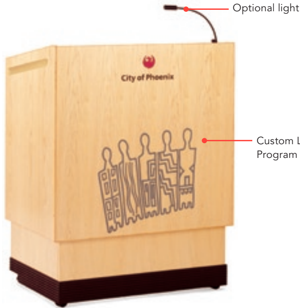
LCLH ADA Lectern Maple (MP) ADA Lectern shown in raised 44" height position. Features a push-button lift mechanism to adjust desired height. The electric lift motor has a one-year warranty.