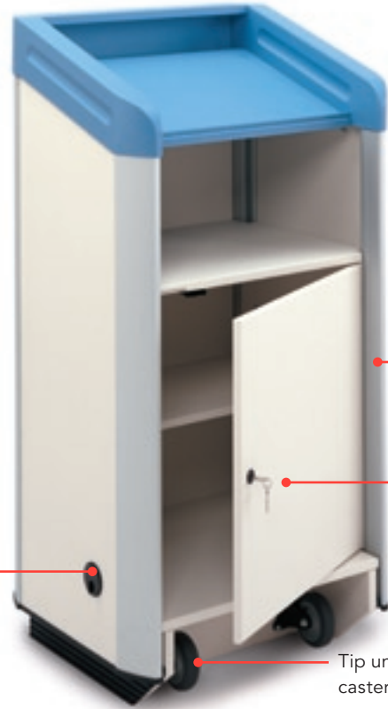
S2LF 202 EganLectern

The classic "Front of House" EganLectern shown in Maple (MP). Available in your choice of Wood Veneer options.