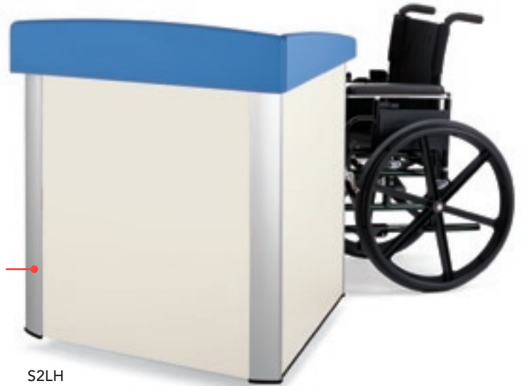
S2LH 202 ADA Lectern Etex combination 202 ADA Lectern shown in lowered 34" height position. Like its classic counterpart, this lectern is also height adjustable with a push-button lift. The electric lift motor has a one-year warranty.