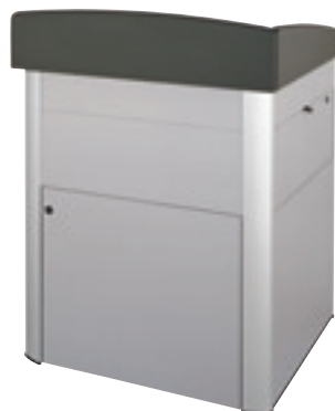
S2IM 202 Mobile Instruction Center Shown in front view.

Possibilities Abound We invite your inquiries for custom modifications to any of our products. Contact Customer Service at 1-800-263-2387 for details.