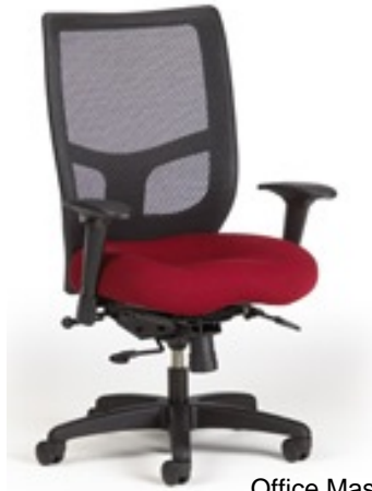
Office Master YS-78

Call Office Furniture & Design Centers today at 242-7575 to schedule an associate to come visit with you about correct ergonomic settings and adjustments.